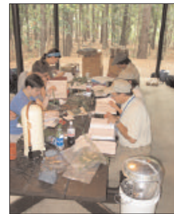
This group is busy identifying the different plant species collected during the blitz.

As the afternoon wore on, we plotted our strategy. Although our mission was to locate as many species as possible, there was one species we all felt compelled to seek out. The Red-cockaded Woodpecker is an endangered species that was once more widespread but in Oklahoma is now only found in the McCurtain County Wilderness Area. Because it establishes colonies for nesting, and during the rest of the year roosts each night in the same cavities, it is almost a sure thing to find if you know where the colonies are located. Fortunately, we had the help of the biologist who closely monitors Oklahoma's small population of these active woodpeckers, and as the sun went down we were treated to good views of several birds returning to their roost. The following morning we continued our efforts, and slowly added a species here and two species there. After a catfish lunch topped off with chocolate cake, we headed back to the Bioblitz staging area for the final tally. Our total of 69 bird species was predictably higher than last year's Bioblitz bird total, but had we chanced upon a major migration day it could have been much higher. Of course the big numbers came from the people who had been counting plants and insects, but all of the species found by all of the teams helped achieve the grand total of 1,017 species for the 24 hours. Bioblitz again showed the great diversity of life that can be found within even a very limited area of our planet.