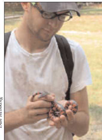
This colorful mudsnake was one of the species seen at the blitz.

The Bioblitz ran from 3 pm on Friday to 3 pm on Saturday. Naturally, my time (besides sleeping) was mostly spent looking for birds, and accompanying me were a number of other ornithologists and birders from around the state. Our first stop? The bird feeders at the park's nature center, of course! We picked up the first easy species there, including chickadees and several woodpeckers which were frequenting the large trees, along with seemingly innumerable squirrels (all the same kind, but that's one mammal for the list!). Inspection of some trees along a small watercourse near the nature center revealed a Worm-eating Warbler, a rather uncommon species we were all happy to find.