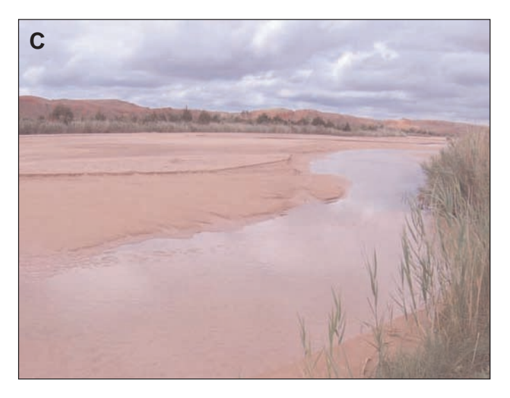
Figure 2. Upland (A), canyon bottom (B), and floodplain (C) habitat on the Four Canyon Preserve, Ellis County, Oklahoma.