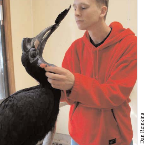
The Sutton Newsletter