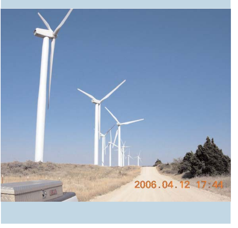
These pictures were taken at a wind farm near Woodward, Oklahoma. Note the size of these turbines compared to the fence next to the road.