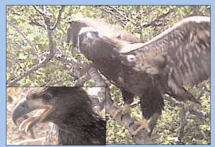
The young eagles begin "branching", gaining flight ablility as the season wears on. Webcam Photos.