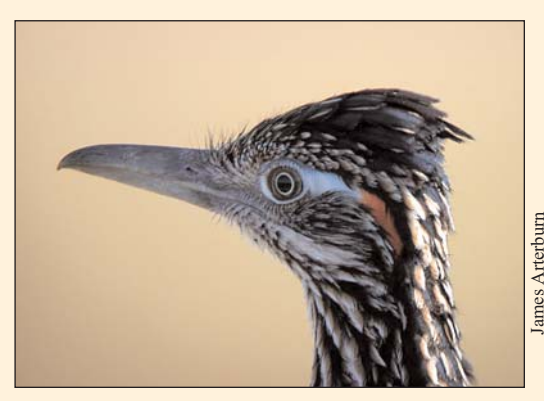
At least a bit of blue orbital skin is always visible on roadrunners, but the orange skin farther behind the eyes can only be seen when the crest feathers are raised.

Roadrunners often sunbathe several hours each day, especially during cooler weather. They orient their back to the sun, extend their wings, and raise their feathers to expose their heavily pigmented, black skin to the warming rays. They also dust bathe, though they do not bathe in water, a likely adaptation to the arid southwestern environments in which they are most abundant.