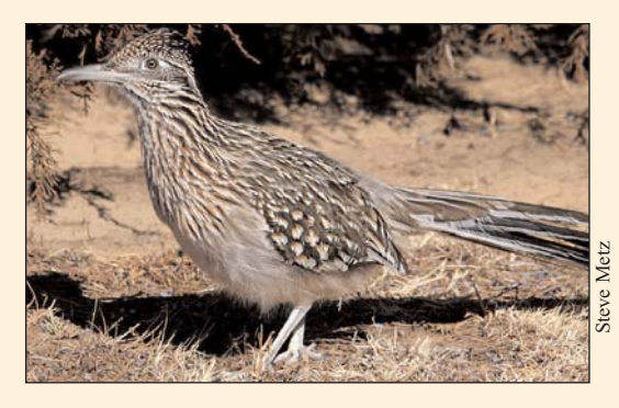
The roadrunner's streaked, brown plumage helps it blend in with its arid environment, and its strong legs can propel it at more than 15 miles per hour during pursuit of prey or while escaping from danger.

At nearly two feet long, including its long tail, the roadrunner's distinctive shape and habit of running make it easy to identify. Roadrunners have zygodactyl feet, meaning that two toes point forward and two point back, resulting in Xshaped tracks. Roadrunners maintain a long-term pair bond and territory, with nesting taking place from April through July. The nest is usually placed in a thorny small bush or tree about 3-10 feet above the ground. It is built by the female with materials brought by the male. A normal clutch consists of 3-6 eggs which are incubated by both sexes for nearly three weeks. The young are fed by both sexes, and leave the nest between 14 and 25 days of age.