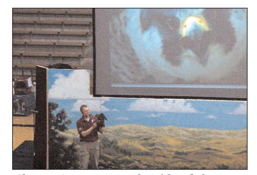
Above: A camera to the side of the stage area projects a live image of the on-stage bird (here a Peregrine Falcon) onto the screen, just like at a football game.