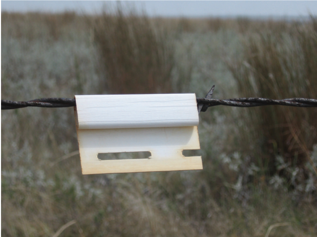
A vinyl fence marker used to help LPCs see fences during flight. Fence marking methodology is available at www.suttoncenter.org/LPCH/fences (44).

influence is magnified. Many other factors diminish existing unfragmented habitats including oil and gas production, road construction, housing development, crop production, excessive livestock grazing and woody plant invasion—this includes native woody plants that have been allowed to become too tall.