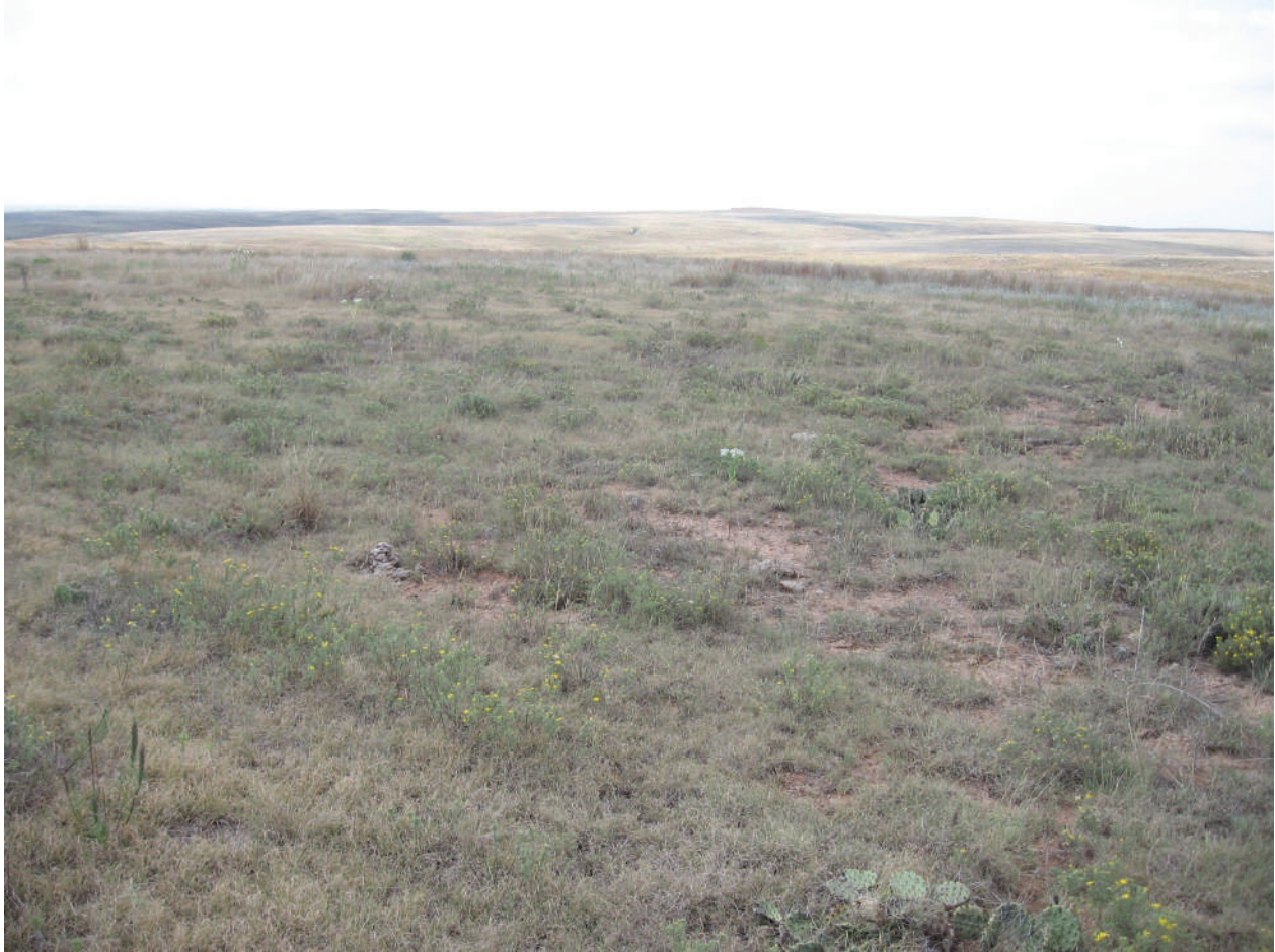
This lek site is on a high ridge that has low and sparse vegetation due to the shallow soil. It provides a good place for lesser prairie-chicken males to be seen and heard.

are not successful. LPCs select tall grass or shrub cover, if available, for nest sites. Thus, unburned and lightly grazed areas within two miles of leks are critical for reproduction (26). LPCs need native grasses that are at least 18 inches tall to completely conceal nesting hens and foraging chicks, as well as provide good thermal cover in winter and summer. Areas with high amounts of sagebrush canopy have been shown to be favored by nesting LPCs (27). Livestock grazing impacts prairie-chicken habitat by changing the amount, kind and pattern of residual grass. Uneven grazing patterns under season- and year-long continuous grazing creates an interspersed pattern of short grass; bare ground; and tall, lightly grazed bunches of grass assuming the livestock stocking rate is appropriate. This structural diversity provides easy travel lanes for broods, abundant access to seeds and insects, and escape cover. Patch burning and the resulting patch grazing will