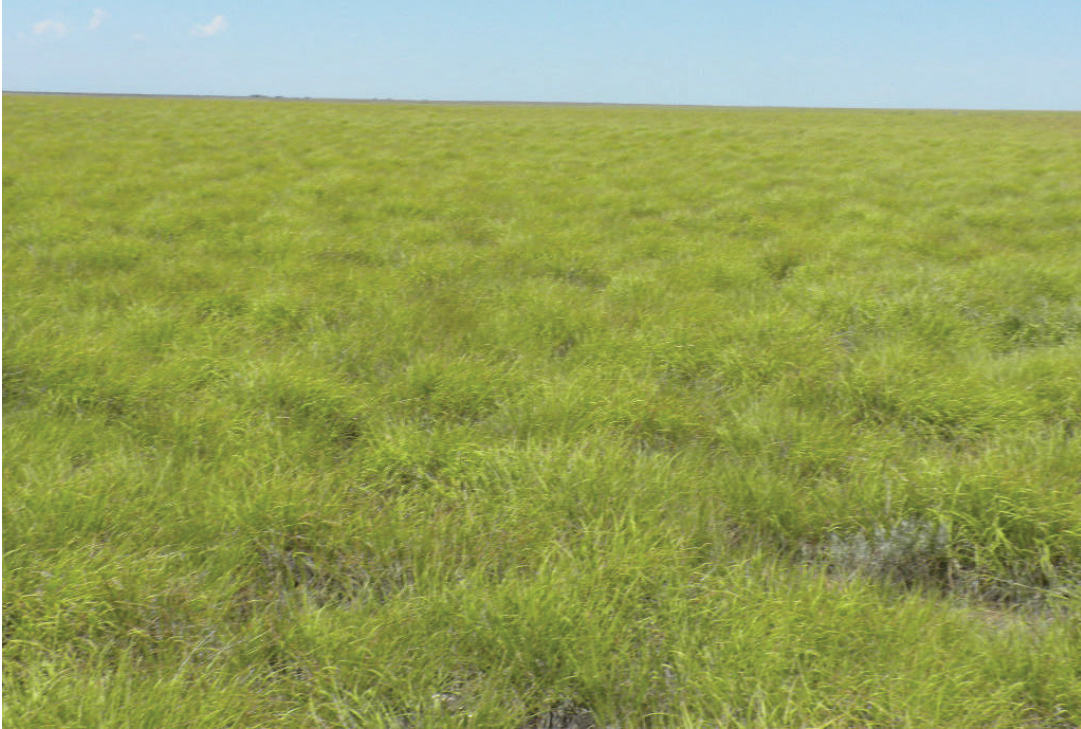
A CRP field in Oklahoma planted to Old World Bluestem. Note the lack of diversity in plant composition and structure. This field will need several applications of herbicide and be planted in a native grass and forb mix to become quality LPC habitat.