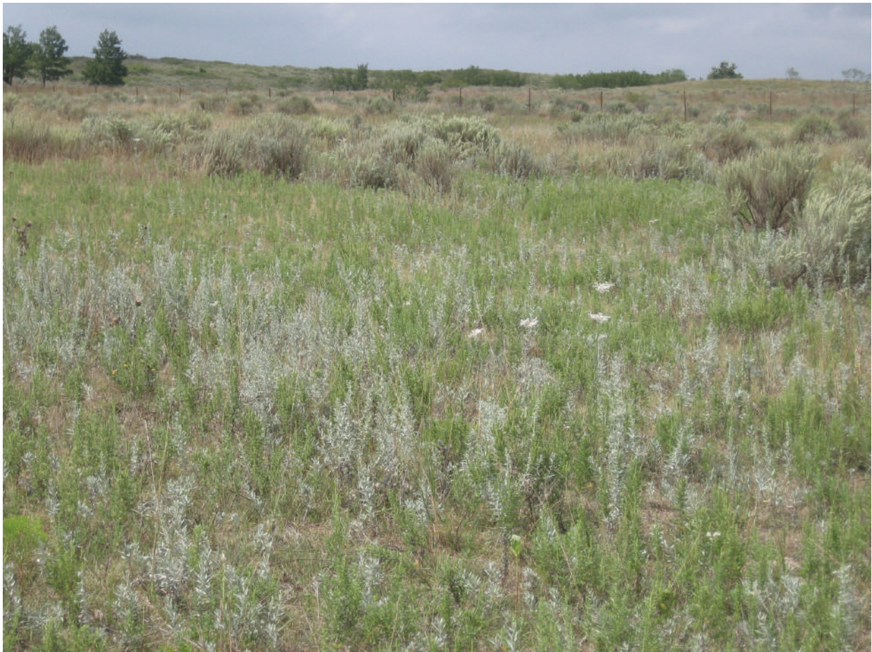
An example of a forb rich area in foreground surrounded by sand sagebrush nesting cover. The foreground is dominated by western ragweed, which is an important food plant for LPC and quail.

LPCs do not require free-standing water (41). Similar to other birds, water requirements are met by the consumption of succulent vegetation and insects. During periods of drought, water from stock ponds and prairie streams may be used but does not appear necessary for this species.