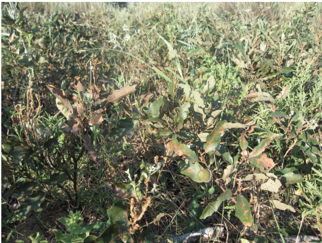
Shinnery oak provides cover and mast for lesser prairie-chickens in portions of their range including New Mexico, Texas, and Oklahoma. The structure of this plant is easily modified as this plant resprouts following fire.