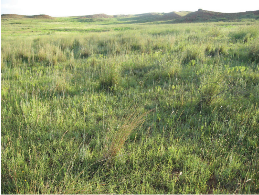
Large landscapes of native grasslands are the cornerstone of lesser prairie-chicken habitat.