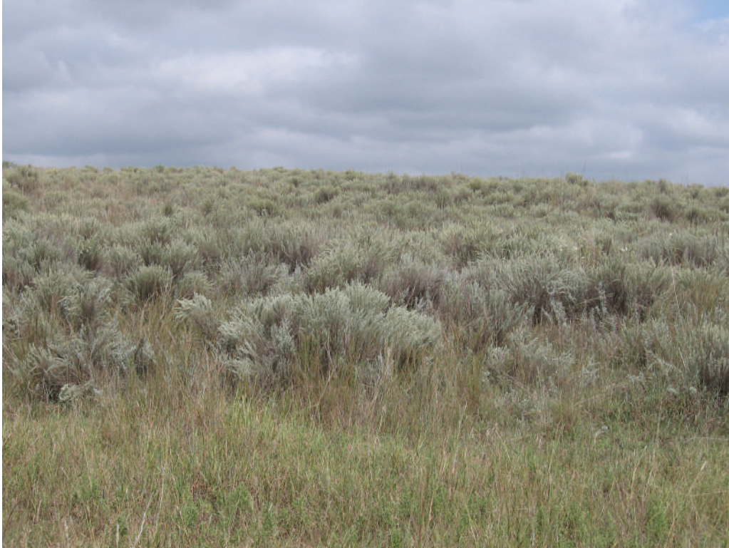
A sand sagebrush community that provides excellent lesser prairie-chicken habitat.