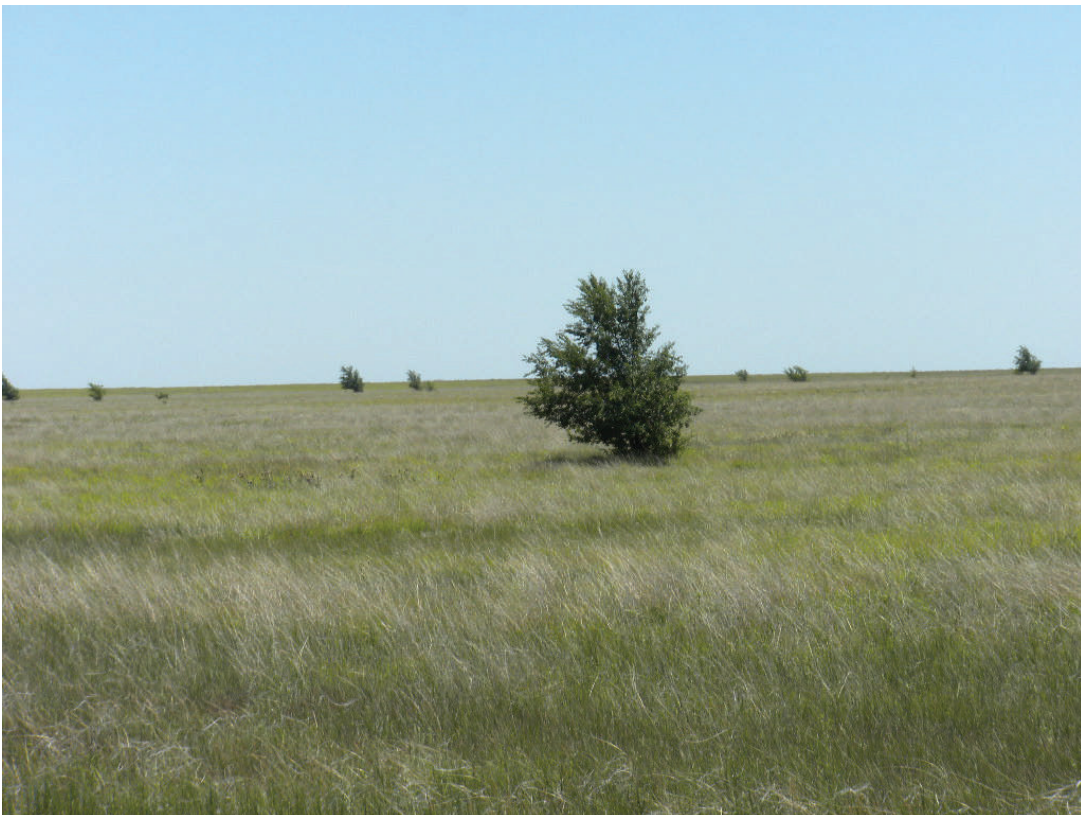
This CRP field has been invaded by eastern redcedar. Fire frequency or mechanical control is the key to prevent this problem.