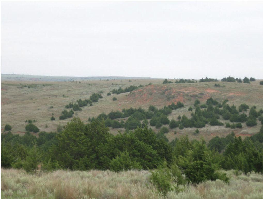
Eastern redcedar is expanding out of shallow soil areas into upland sites due to fire suppression. These upland sites could be occupied by LPCs if the redcedar were removed.