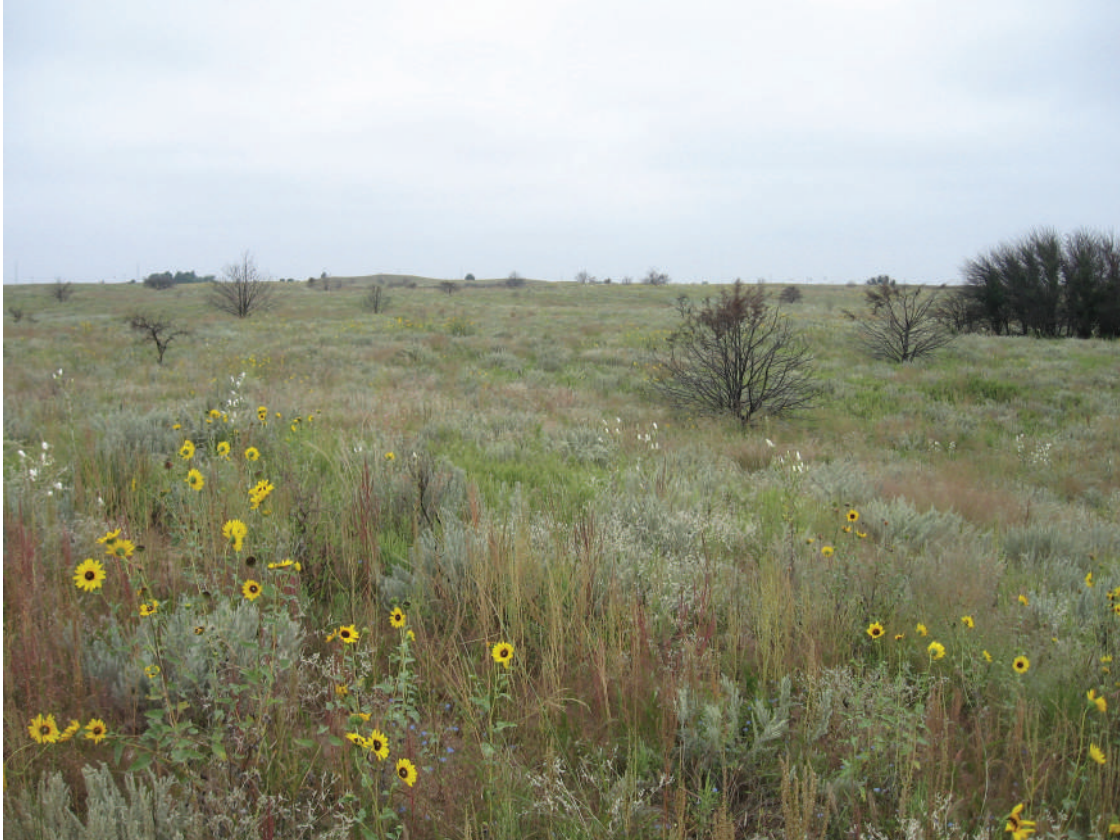
Vegetation response six months after a fire. Note the abundant forbs present and the redcedar skeletons.

to the LPC, while also maintaining high forage quality for livestock. Patch burning has been shown to increase plant and animal diversity without negatively affecting livestock production (12). By using fire in this patchwork pattern, cattle rotate themselves around the pasture following the recent fire. This reduces high cost, high input management. This system also allows stockpiling grass (grass banking) for dormant season grazing (reduces winter feed costs) or for LPC nesting, as well as providing additional forage during drought. Except for actually conducting the burn, no additional labor or structures are required over typical rotational grazing with fences. Additionally, existing cross fences can be removed, which will benefit the LPC by reducing fence collisions. Thus, this fire-grazing interaction has the potential to be beneficial to the LPC and other wildlife species.