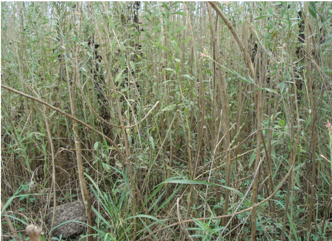
Forb dominated communities are typically open at ground level, which aids in chick movement and foraging, and provides escape cover.