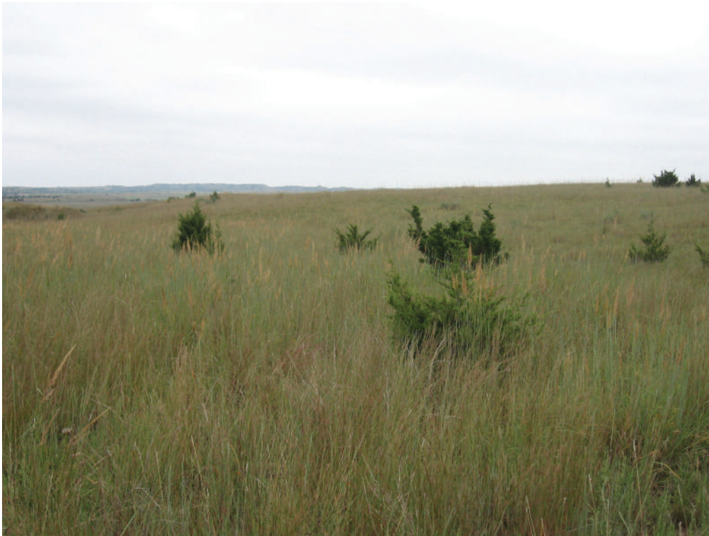
Young eastern redcedar is easily controlled with fire. However, within 7-10 years it becomes difficult to remove without expensive mechanical control or very intense fire.