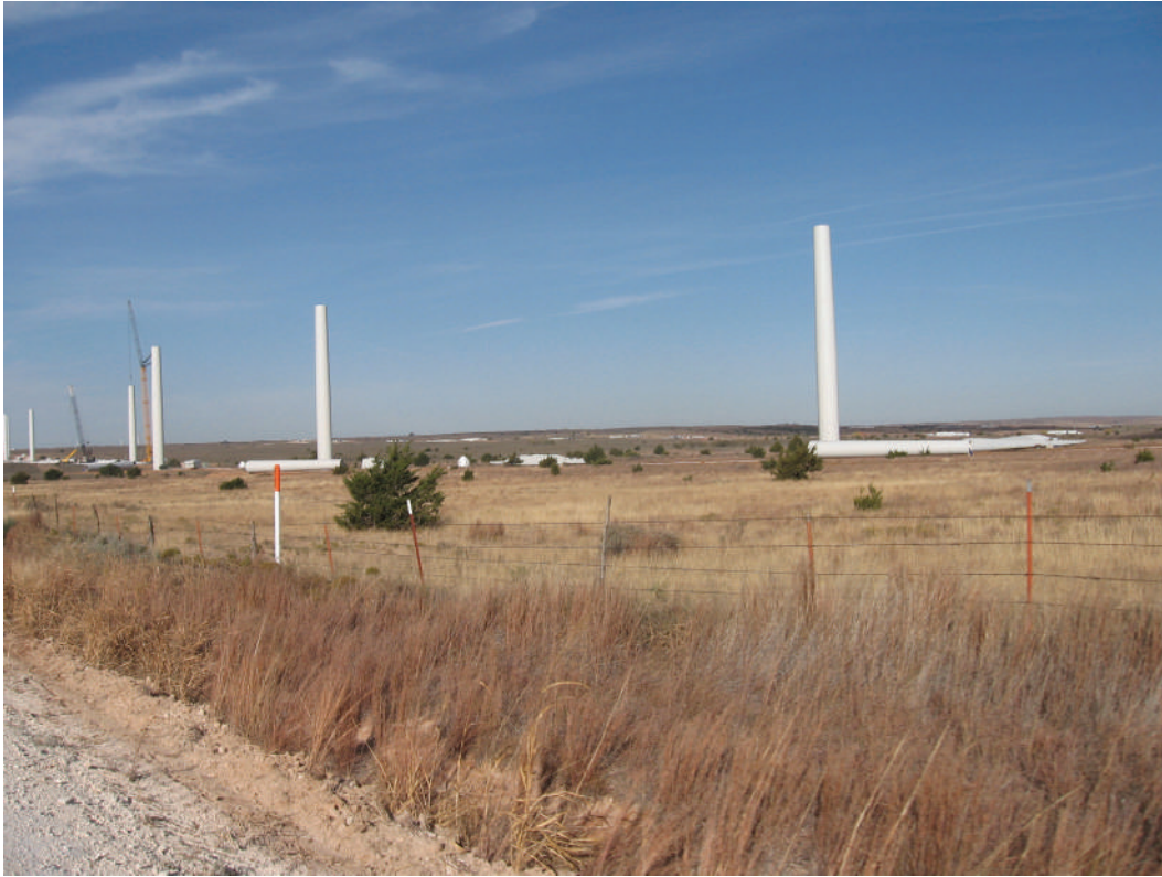
Fragmentation can come from many sources including wind turbines, roads, fences, trees, oil and gas wells, and power lines.