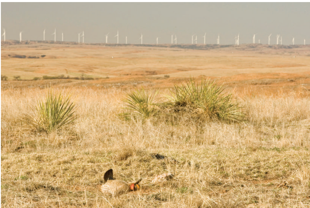
Lesser prairie-chickens struggle to survive with new threats on the horizon.