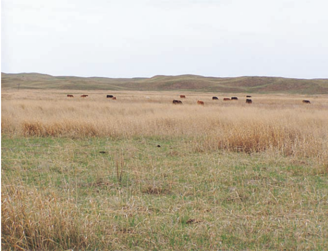
Figure 8. The Valentine National Wildlife Refuge in north-central Nebraska represents a true success story in greater prairie-chicken management. Historically, cattle grazed season-long across almost the entire refuge and all of the productive subirrigated meadows were hayed. During this time, greater prairie-chickens were present, but at dangerously low levels. Current management focuses on impacting (grazing and burning) approximately 40–45% of the refuge annually using short-duration summer grazing at dramatically reduced stocking rates. Additionally, annual haying of meadows has been almost entirely eliminated on the refuge. In response to these management changes, greater prairie-chicken populations have increased by an order of magnitude and have maintained this level for almost 20 years.

spring grazing treatments at about 0.55AUM/acre on approximately 40% of VNWRs subirrigated meadows, and short-duration summer grazing at about 0.2AUM/acre on approximately 45% of upland acres. This is in contrast to the season-long (summer, fall, or winter) grazing practices of years past. The VNWR has also initiated a spring burning program to reduce encroaching woody plant species, promote warm season grasses, and reduce invasion of Kentucky bluegrass ( Poa pratensis ). Between prescribed fire and grazing, about 30–40% of the refuge is currently disturbed on an annual basis, compared to a high of over 90% in 1969.