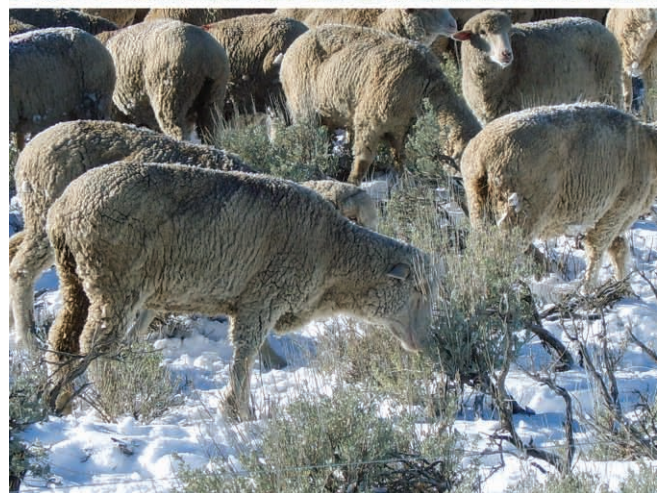
Figure 2. Small-scale reduction of shrubs using mechanical (top), partial-kill herbicide (middle), and grazing (bottom) treatments can be used to increase compositional and structural habitat diversity in high elevation sagebrush sites. These treatments have formed the basis of management plans that have produced notable increases in sage-grouse habitat quality at Deseret Land and Livestock and Parker Mountain in Utah. Treatments are applied mainly to breeding habitat at patch- to local-level scales. Large-scale shrub reduction is undesirable and negatively impacts both breeding and winter habitat. Sheep image courtesy of Michael Guttery; remaining images courtesy of Rick Danvir.