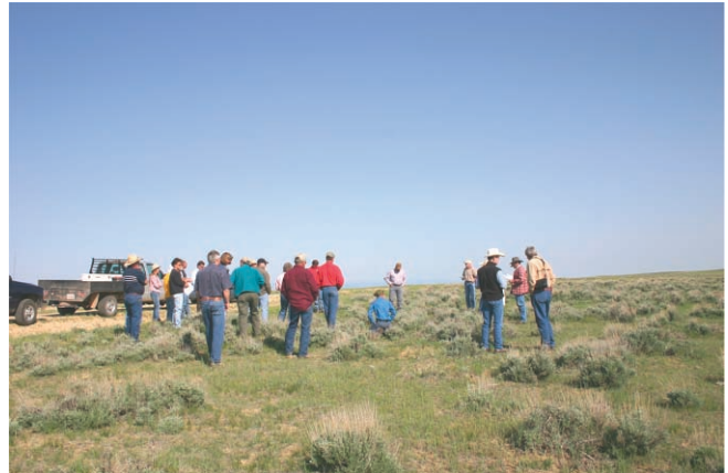
Figure 3. The Sagebrush/Grassland Restoration Project is bringing together ranchers and conservation groups in an effort to promote sage-grouse conservation at a landscape scale in Wyoming. At present, this project involves 24 ranchers who collectively control management on 340,000 acres. Biologists and Natural Resources Conservation Service (NRCS) Range Conservationists work with ranchers to conduct resource inventories, determine resource conditions and seasonal use patterns of sage-grouse, and create management plans that complement the habitat needs of sage-grouse and other wildlife species.

Despite the positive response of grouse on Parker Mountain to increased habitat diversity in treated areas, Dahlgren stresses that the healthiest populations of sage-grouse are associated with large expanses of contiguous sagebrush cover. He emphasized that the role of the habitat manager is to create habitat resources through shrub reduction in small patches (“Think of the ‘chips’ in a chocolate chip cookie,” says Dahlgren) to meet seasonal habitat requirements. The optimal proportion of the landscape occupied by those patches will vary, depending on seasonal habitat needs. For example, when managing for late brood-rearing habitat, up to 40% of the land base can be treated, but where late brood-rearing habitat overlaps with nesting/early brood rearing or wintering habitat, conservative sagebrush treatments (e.g., 20% of land area) are more appropriate. Considering sagebrush type and ecological site are also important when determining best land management practices. For example, on Parker Mountain, mountain big sagebrush is typically not used in winter due to snowpack at higher elevations, but black