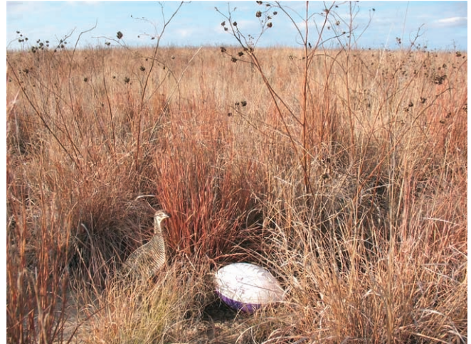
Figure 5. Prairie-chicken populations in western Kansas have benefitted from Conservation Reserve Program (CRP) stands that incorporated a diverse mix of native warm-season grasses and forbs, with vegetation ranging from mid-shin to mid-thigh height. Periodic disturbance is necessary to maintain forb abundance and an open habitat structure. Western wheatgrass and smooth brome have been invasive in many Conservation Reserve Program (CRP) stands, resulting in reduced structural and compositional diversity and diminished value for prairie-chickens. Interseeding of existing CRP with forbs such as alfalfa, provides structural heterogeneity and can increase invertebrate biomass (a high-protein food source) up to three-fold.

Much of the range of all the lekking grouse addressed in this article has been impacted by the Conservation Reserve Program (CRP), a federal program that promotes seeding of marginal croplands to permanent vegetation, usually grasses. Biologist Randy Rodgers with the Kansas Department of Wildlife and Parks has been part of an effort to document the effects of this program, particularly for lesser and greater