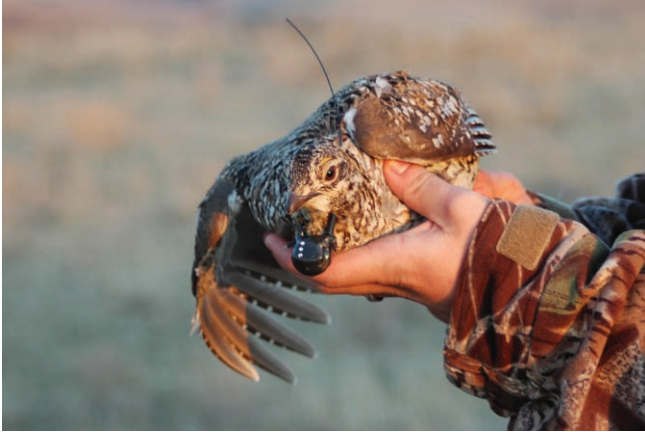
Figure 7. Radio-marked sharp-tailed grouse prior to release on Fort Pierre National Grassland in South Dakota. Researcher K.C. Jensen has found that grazing management practices can impact prairie grouse (sharp-tailed grouse and greater prairie-chickens) populations. In this study, hen survival, nesting success, and brood survival were higher in association with later turnout date (June vs. May), shorter grazing season (5 vs. 7 months), and an increased proportion of the landscape rested from grazing (18% vs. 5%).

This loss has accentuated the value of remaining habitats, most of which are grazed by livestock. Researcher K. C. Jensen and his graduate students have been studying the role of grazing in influencing prairie grouse habitat by comparing livestock grazing practices and prairie grouse habitat characteristics and population metrics on two divergently managed national grasslands (Fig. 7).