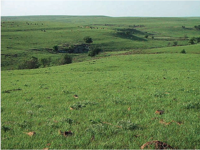
Figure 4. Annual spring burning, combined with intensive early livestock use, is associated with homogenization of large areas of tallgrass prairie in Oklahoma and Kansas, and also declines in populations of greater prairie-chickens. However, research in northeastern Oklahoma suggests that small-scale (i.e., patch) burning, combined with grazing, can create a shifting mosaic of successional stages that is associated with increasing greater prairie-chicken populations.

infrequent at a given location, vegetation has adequate time for recovery. The net effect of this management process is to create a shifting mosaic of successional stages at the landscape scale that provides habitat conditions to fulfill the different life history requirements of greater prairie-chickens.