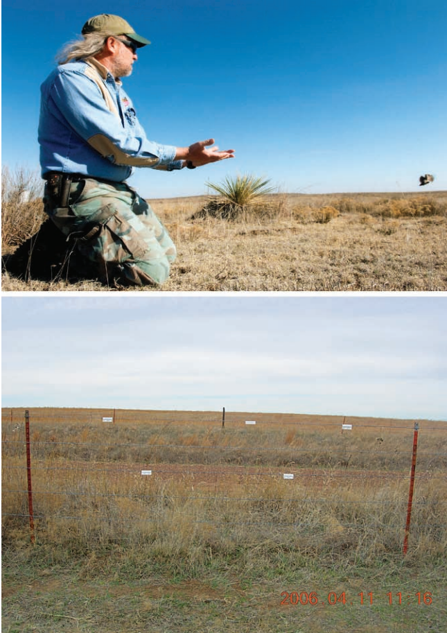
Figure 6. Lesser prairie-chickens fly fast and low to the ground, resulting in substantial mortality due to fence collisions. Here (top) biologist Don Wolfe releases a radio-marked lesser prairie-chicken. Ongoing research at the Sutton Avian Research Center in Oklahoma suggests that fence marking (bottom) with white plastic strips can dramatically reduce collision mortality.

needed for year-round habitat. For example, interseeding of the CRP stands with forbs, such as alfalfa ( Medicago sativa ), has increased structural heterogeneity and has increased invertebrate biomass up to three-fold. Other practices used to create habitat diversity in CRP stands include livestock grazing, prescribed fire, and disking (often associated with fire-break installation) to promote forb abundance. Although nonaggressive introduced species such as alfalfa have been used in western Kansas CRP plantings, aggressive species such as smooth brome ( Bromus inermis ) and western wheatgrass ( Pascopyrum smithii ) have been strongly discouraged. The overall thrust of plantings here has emphasized compositionally (grasses, forbs, and shrubs where appropriate) and structurally diverse plant communities with stand heights from “shin to thigh high.”